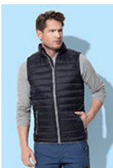
ST5210 Padded Vest