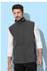
ST5010 Fleece Vest