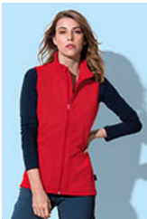
ST5110 Fleece Vest