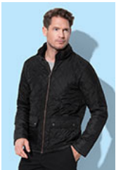
ST5260 Quilted Jacket