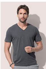
ST9410 Shawn Slub V-neck