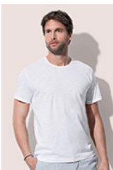
ST9400 Shawn Slub Crew Neck